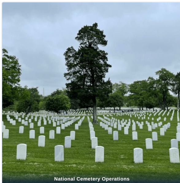
National Cemetery Operations